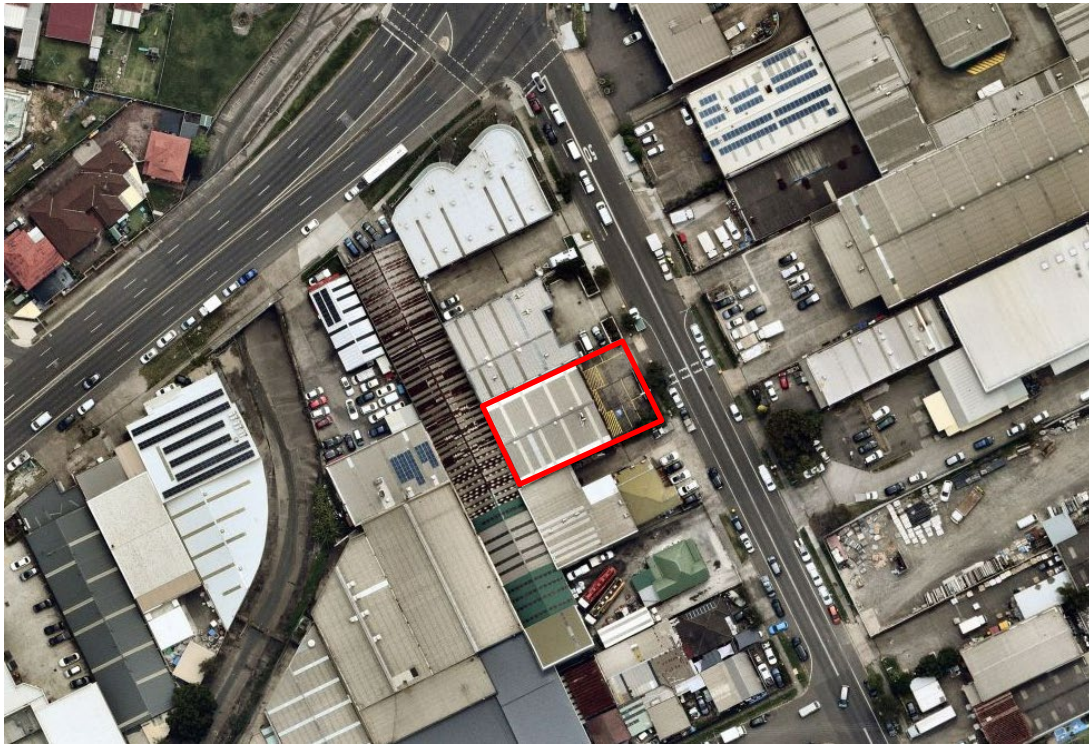
Figure 1 - Site Aerial

Figure 1 provides an aerial photograph of the site and overall locality. A site plan is included in Figure 4 below.